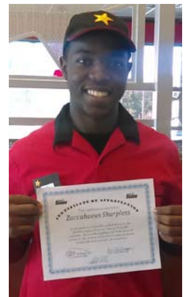
Zaccariaeus Sharpless Hardee's (Richland Hwy)