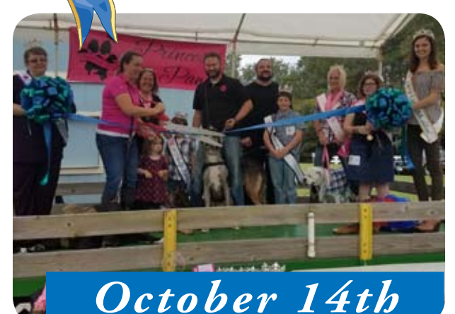
Princess for Paws (Raising funds for the training of service dogs)

For more information, please call 910-347-3141 or visit us online at www.jacksonvilleonline.org