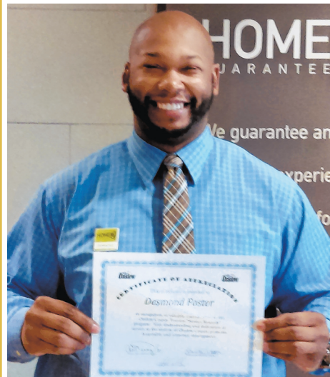
Desmond Foster Home 2 Suites