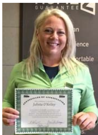
Julieta O'Kelley Home 2 Suites