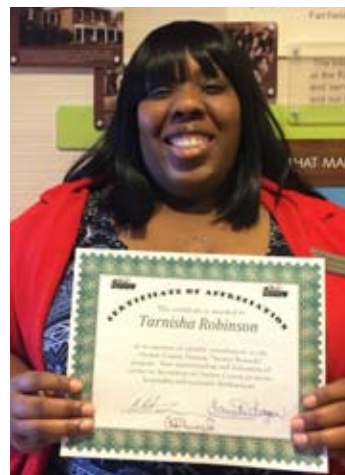
Tarnisha Robinson Fairfield Inn