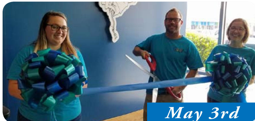
Giggles Drop-In Childcare 1250-M Western Blvd. Jacksonville NC 28546