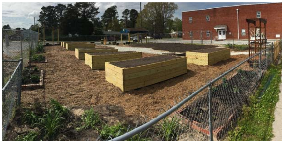
The Completed Community Garden at Philippians Place

This is an exciting and impactful addition to Onslow County! This program has the potential to allow our community to work together to reduce homelessness in our community. This program only works through donations of time, money, and resources from others. If you would like more information, or are able to donate your time and resources, please reach out and help end the cycle of homelessness in Onslow County, one person at a time!