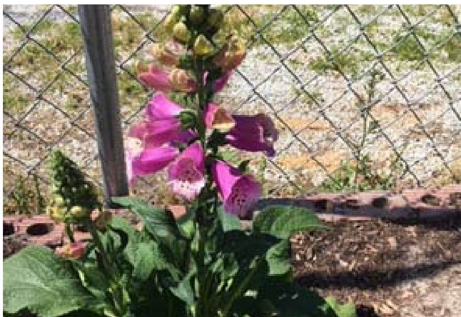
Digitalis pupurea "Foxglove Dalmatian Rose" – One of several varieties of pollinator plants installed in the Community Garden