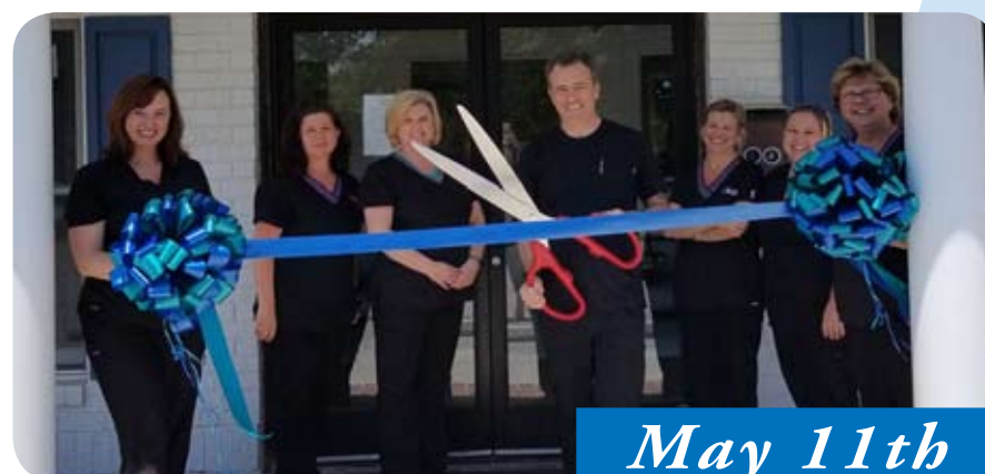
Buglisi Eye Care 1021 Hargett St. Jacksonville, NC 28540