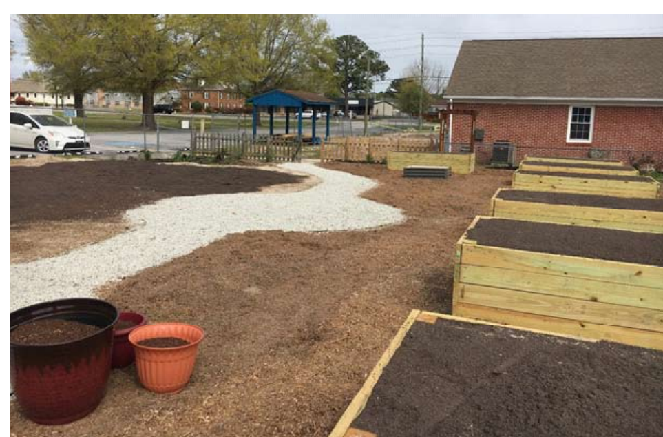
Path and Raised Beds inside the Philippians Place Community Garden