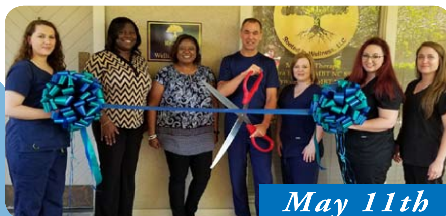
Rooted in Wellness 200 Doctors Drive Suite J, Jacksonville, NC 28546