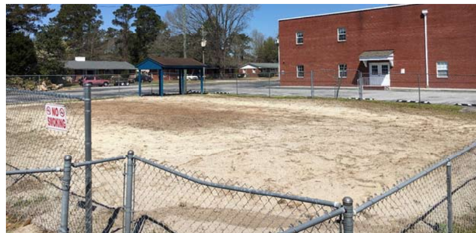
The area at Philippians Place before the Community Garden installation