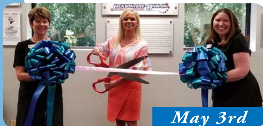
Pink Trash (at the Commerce Center) 1099 Gum Branch Rd, Jacksonville, NC 28540