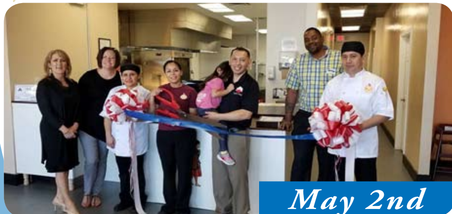
Pollos Tete 222 Brynn Marr Rd. Jacksonville, NC 28546