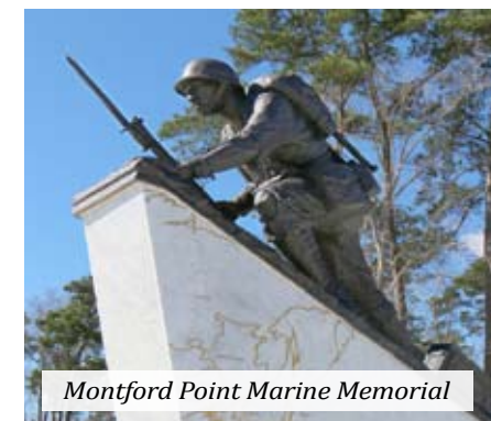
Montford Point Marine Memorial