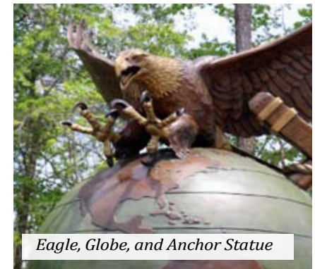
Eagle, Globe, and Anchor Statue