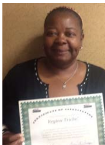
Regina Triche' Hampton Inn and Suites, Jacksonville