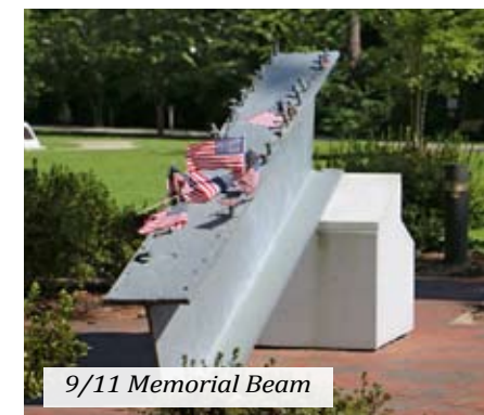
9/11 Memorial Beam