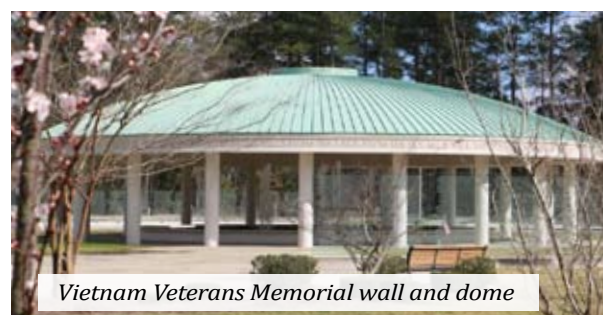
Vietnam Veterans Memorial wall and dome