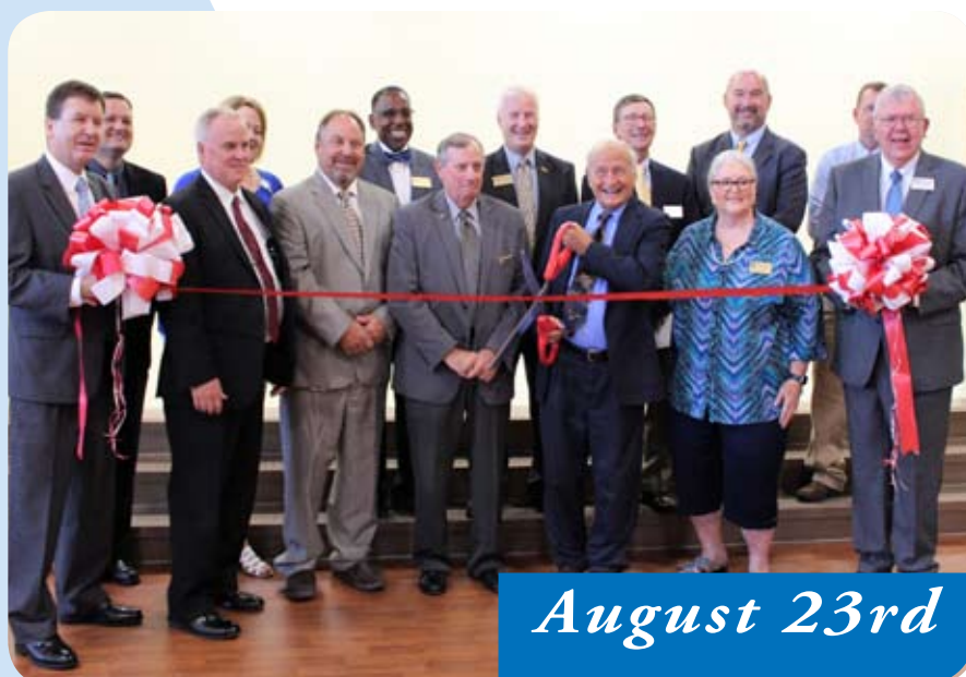
NEW Richlands Elementary School Richlands