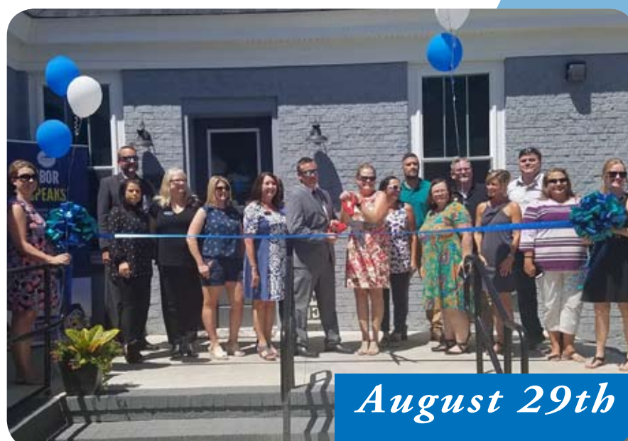
Jacksonville Board of Realtors 200 Preston Rd. Jacksonville, NC