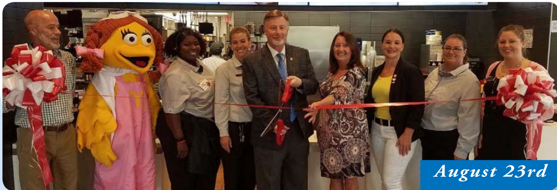
McDonalds 404 Western Blvd. Jacksonville, NC