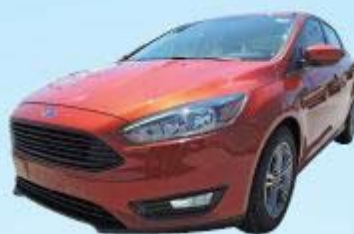
2018 FORD FOCUS