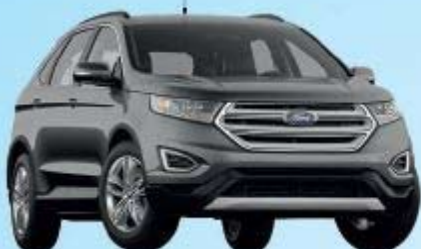
2018 FORD EDGE