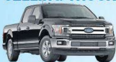
2018 FORD F-150