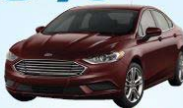
2018 FORD FUSION

SEPTEMBER IS NATIONAL FIRST RESPONDERS MONTH