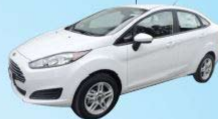
2018 FORD FIESTA