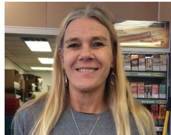
Patricia Herndon Speedway