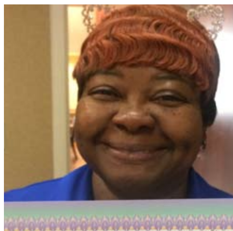
Regina Trishe Hampton Inn, Western Blvd

A community is only as good as the citizens that live and work within its borders. This month we celebrate the frontline employees that go the extra mile to make your visits an above average experience in Swansboro, Sneads Ferry, Richlands, and Jacksonville! The two individuals, representing five area businesses; have performed their duties with a positive outlook, a kind word, and valued information for our visitors and citizens - they went the extra mile! Onslow County Tourism and the Jacksonville•Onslow Chamber of Commerce want to thank them for their efforts and encourage you to do the same. Good service is good business!