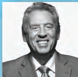
John C. Maxwell

John C. Maxwell, the #1 New York Times bestselling author, coach, and speaker