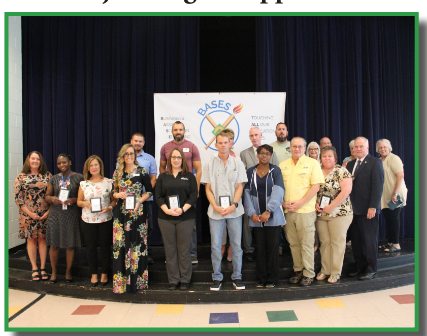
Hall of Fame Supporters