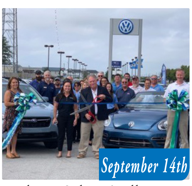
Parkway Subaru/Volkswagen of Jacksonville