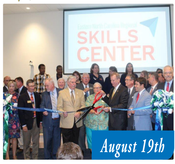
Eastern Carolina Regional Skills Center 261 Northwest Corridor Blvd